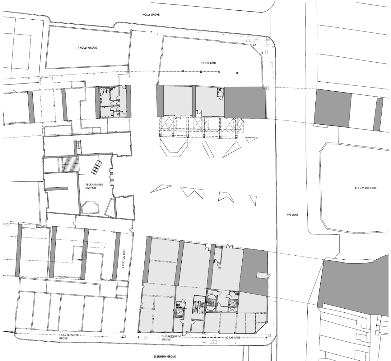
Diagram 00 – Proposed site plan